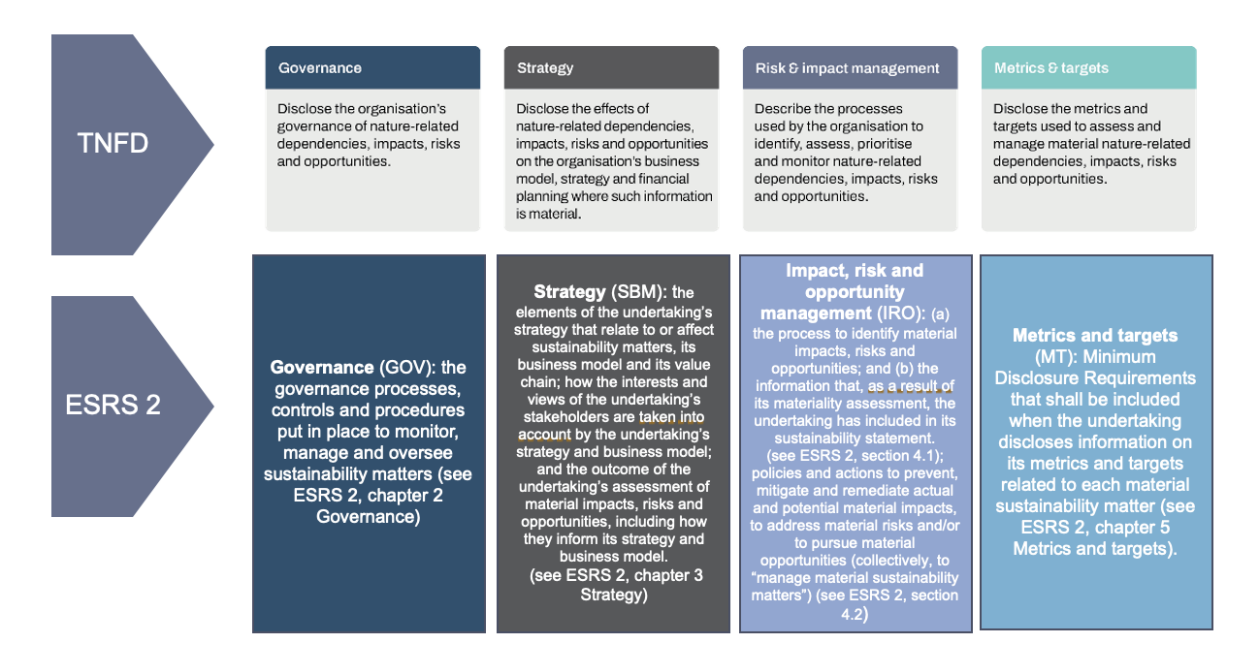
Figure 3: Both the TNFD and CSRD have followed the TCFD four pillars with adaptation to enable double materiality

These four pillars or reporting areas were originally identified by the TCFD (which calls the third pillar 'Risk management') and are also embedded into other standards like the IFRS sustainability standards S1 and S2.