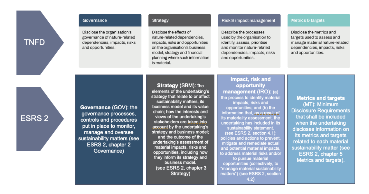
Figure 3: Both the TNFD and CSRD have followed the TCFD four pillars with adaptation to enable double materiality

The TNFD and ESRS both cover the same four pillars of disclosures or reporting areas: Strategy; Governance; Risk and Impact Management (TNFD) / Impact, risk and opportunity management (ESRS); and Metrics and Targets. These four pillars or reporting areas were originally identified by the TCFD (which calls the third pillar 'Risk management') and are also embedded into other standards like the IFRS sustainability standards S1 and S2.