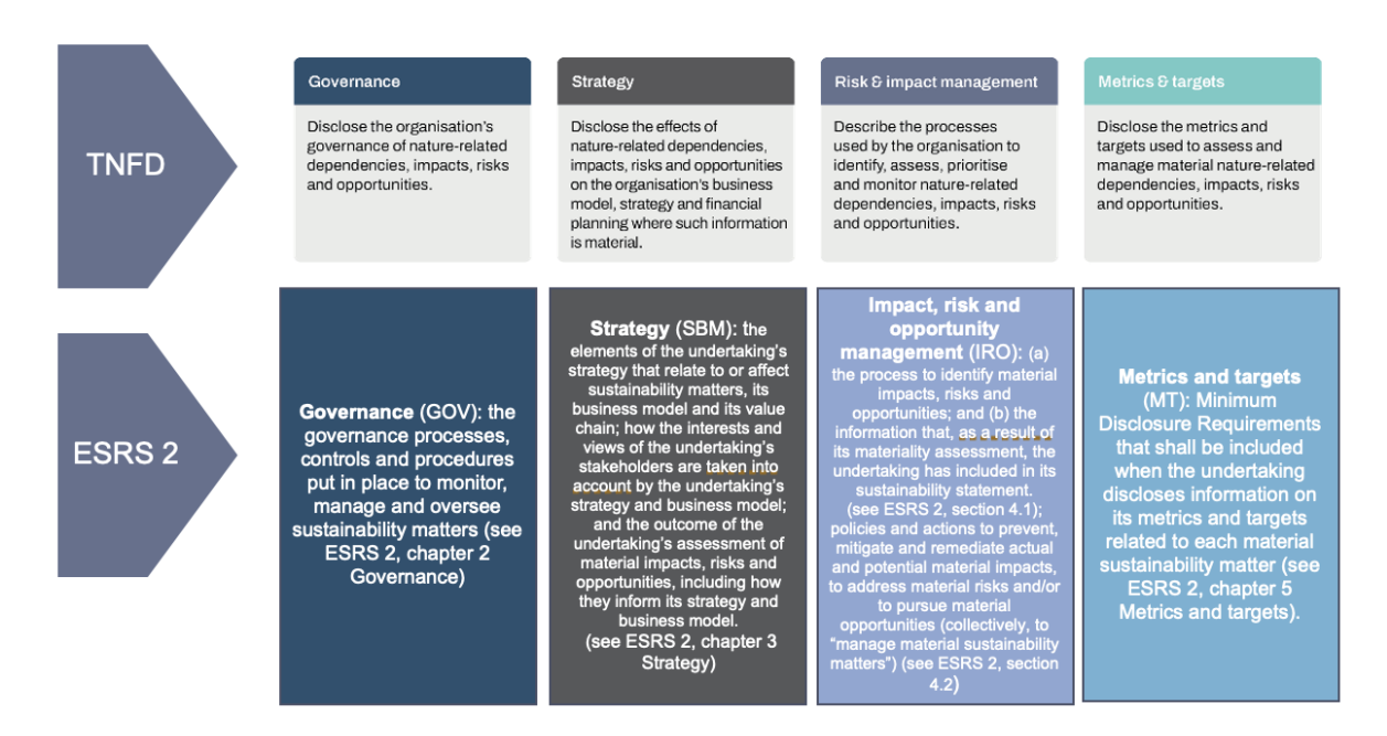
Figure 3: Both the TNFD and CSRD have followed the TCFD four pillars with adaptation to enable double materiality

The TNFD and ESRS both cover the same four pillars of disclosures or reporting areas: Strategy; Governance; Risk and Impact Management (TNFD) / Impact, risk and opportunity management (ESRS); and Metrics and Targets. These four pillars or reporting areas were originally identified by the TCFD (which calls the third pillar 'Risk management') and are also embedded into other standards like the IFRS sustainability standards S1 and S2.