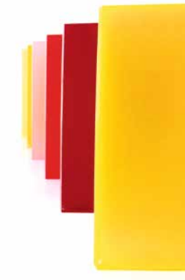
EFRAG Insurance Accounting Working Group